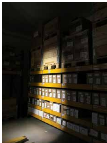
Driving (bottom banks of LEDs)