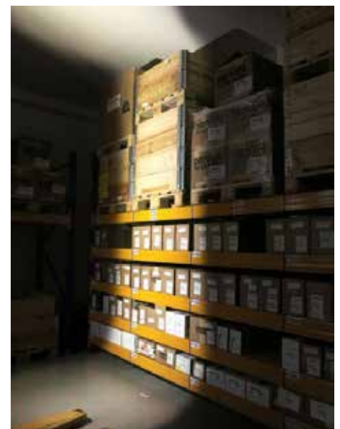
Full (both banks of LEDs)